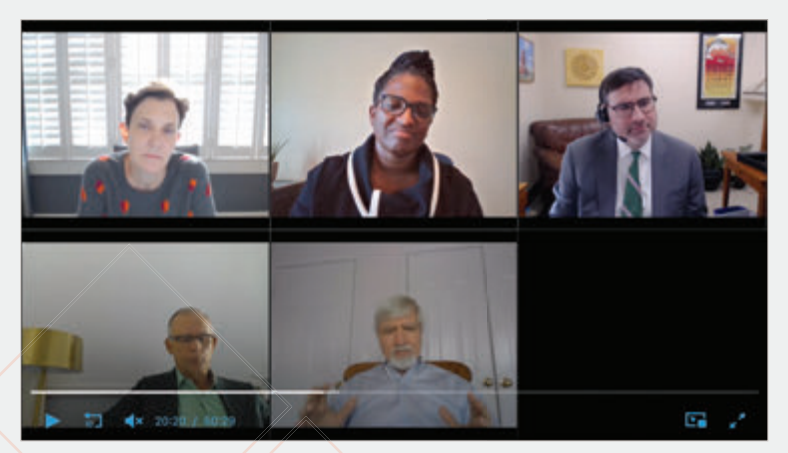
NAPA Webcast: ESG: A Holistic Approach for DC Plans