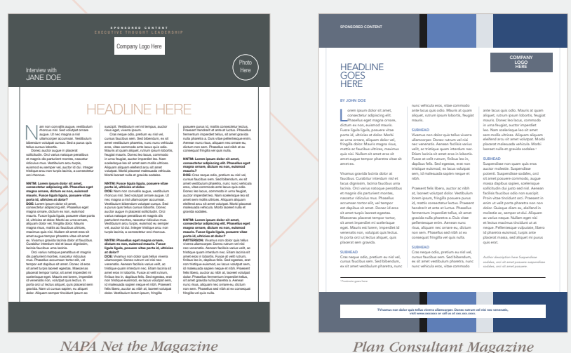
NAPA Net the Magazine

NAPA Net the Magazine and Plan Consultant magazine (ASPPA) have a section devoted to featured articles contributed by Content Contributor Partners, with a link to your website where the content is hosted. CCP may provide up to three links in the publication to different stories or white papers of your choosing. Featured articles/content will be included in a minimum of one issue of the printed magazine.